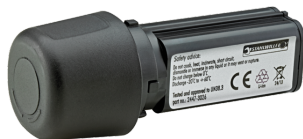
54101195 Li-ion battery for No.714