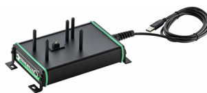
52110062 Docking station for No.714