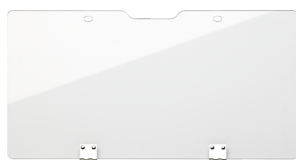
89010100 Transparent cover