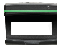
52110220 Bluetooth Low Energy