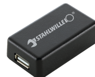
52110061 Interface adaptor