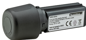
54101195 Li-ion battery for No.714