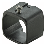
54100070 QuickRelease safety lock