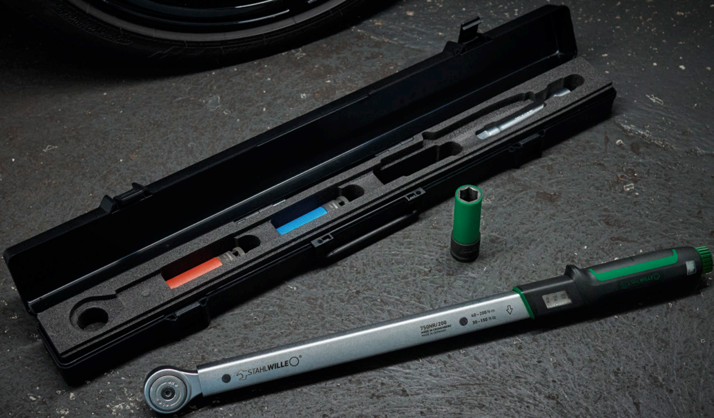
Wheel mounting set 750NR/200/3/1 Product no. 96507216

Stay true to yourself: Our 750NR/200/3/1 wheel change set helps you to organise your work without tension and stress. With proven STAHLWILLE precision and the satisfaction of having secured the optimum price-performance ratio! Including: Our 750NR torque wrench with spring mechanism, three wheel nut sockets and an extension.