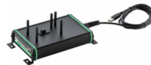
52110062 Docking station for No.714