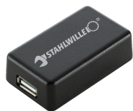
52110061 Interface adaptor