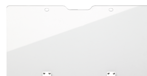
89010100 Transparent cover