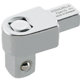
58240010 Square drive insert tool