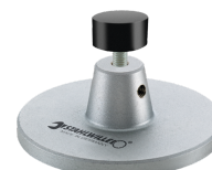
52110162 Rest for docking station No.7762