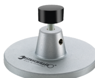
52110162 Rest for docking station No.7762