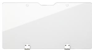
89010100 Transparent cover