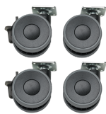
96894805 Set of wheels