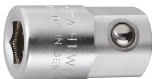
11180020 Bit holder