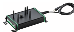
52110062 Docking station for No.714