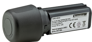
54101195 Li-ion battery for No.714