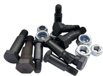
87980100 Cutter head screw set