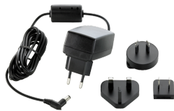
52110056 Mains adapter