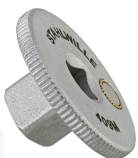
11030010 Square drive adaptor