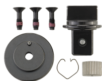
59251040 Spare parts set