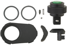
19012020 Ratchet spare parts set