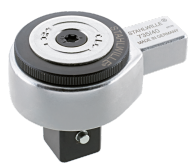
91852510 Fine-tooth ratchet insert adapter