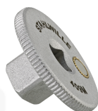
11030010 Square drive adaptor