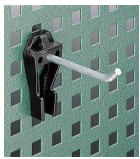
80310090 Single hook