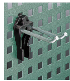
80320060 Twin hook