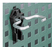
80350020 Square lug