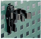
80360018 Spring clip