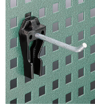
80310030 Single hook