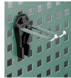
80320030 Twin hook