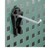
80310060 Single hook