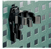
80360024 Spring clip