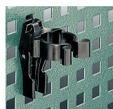
80360012 Spring clip