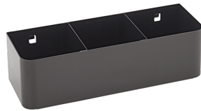
90432727 Spray can holder