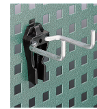
80340040 Twin hook