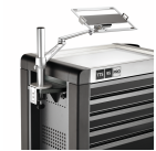
89010041 Laptop holder