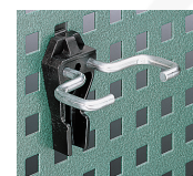
80350017 Square lug