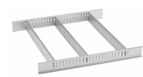
81484002 Drawer divider