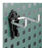
80340050 Twin hook