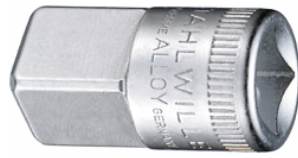
12030003 Square drive adaptor