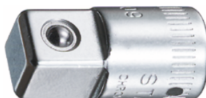
11030002 Square drive adaptor