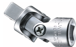
12020000 Universal joint