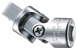
12020000 Universal joint