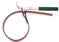
76500001 Strap wrench