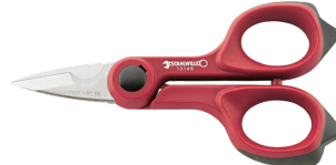
75270003 Wire cutter