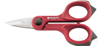
75270003 Wire cutter