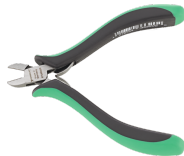
67086000 Mini electronics side cutter