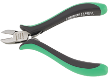
67076000 Electronics side cutter