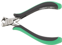
67106000 Electronics diagonal cutter