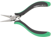
67116000 Electronics needle-nose pliers