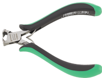
67096000 Electronics end cutter