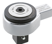
58250040 Fine-tooth ratchet insert adapter