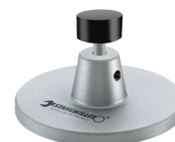
52110162 Support for docking station No. 7762