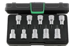
96032008 Screwdriver insert set