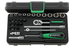
96011136 Socket set