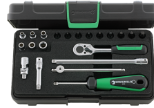
96013701 Socket set TORX®