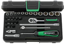
96011138 Socket set