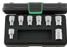
96033704 TORX® socket set