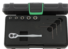
96016303 HI-LOK™ socket set