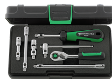
96014010 Tool set