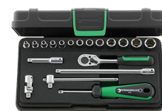
96011124 Socket set