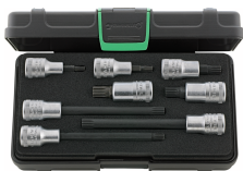
96033606 Screwdriver socket set