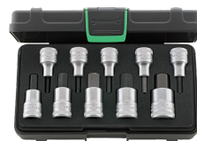
96031508 INHEX socket set No.54