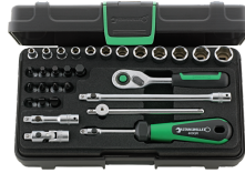
96011182 Socket set