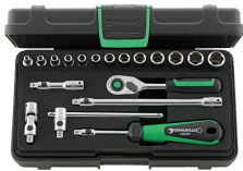
96011180 Socket set