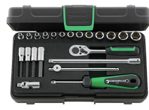
96011113 Socket set