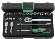
96015208 Socket set