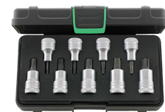
96031901 Screwdriver insert set