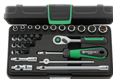
96011137 Socket set