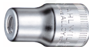
12180026 Bit holder