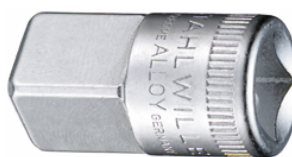
12030003 Square drive adaptor