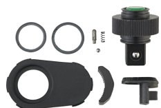
19021020 Ratchet spare parts set