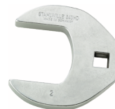
02501050 Crowfoot wrench heavy-duty