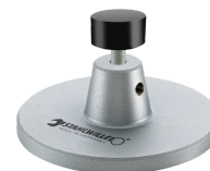
52110162 Support for docking station No. 7762