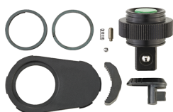
19042020 Ratchet spare parts set