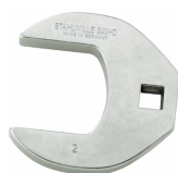
03501064 Crow-foot spanner heavy-duty