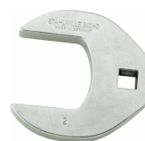
03501069 Crow-foot spanner heavy-duty