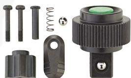
19040040 Ratchet spare parts set