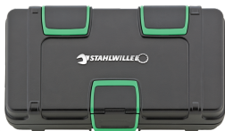
81251019 Tool case