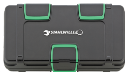
81251019 Tool case