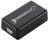
52110061 Interface adapter