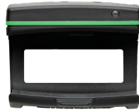
52110220 Bluetooth Low Energy module 714