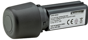
54101195 Li-Ion battery