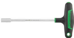
43233100 Nut spinner