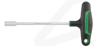
43233130 Nut spinner