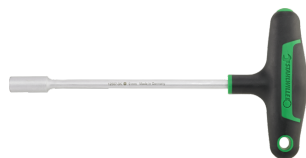
43233080 Nut spinner