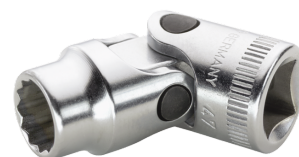
02040017 UNIFLEX socket