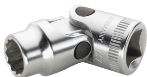
02040019 UNIFLEX socket