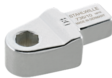
58262610 Bit holder tool