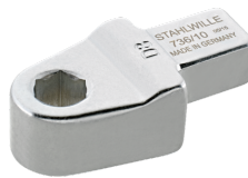
58261010 Bit holder tool