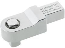
58243012 Calibrating square drive insert tools