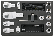
96585224 Calibration accessory set