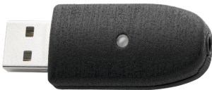
52111057 USB adapter