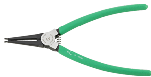
65456102 Circlip pliers for external circlips