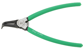
65466121 Circlip pliers for external circlips