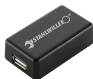
52110061 Interface adapter