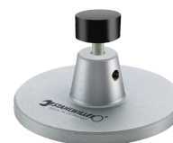
52110162 Support for docking station No. 7762