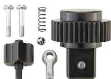
19070000 Ratchet spare parts set