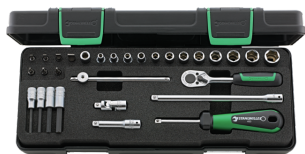
96011134 Socket set