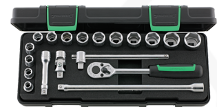
96023132 Socket set