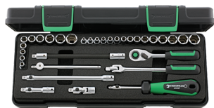
96010107 Socket set