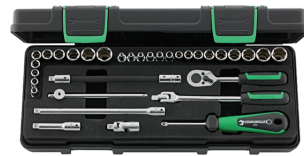
96011162 Socket set