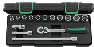
96021109 Socket set