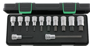
96031503 Set of INHEX sockets