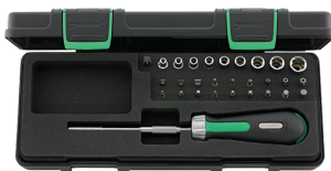
96182203 Bit ratchet screwdriver set