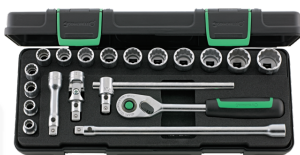
96021180 Socket set