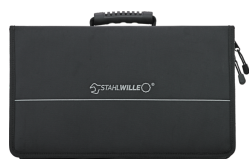
81230103 Textile bag