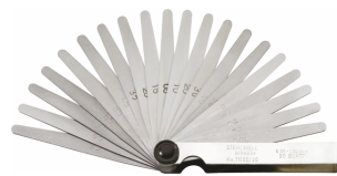
74240001 Precision feeler gauges