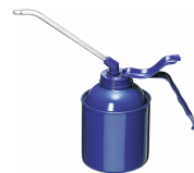
77010001 Force feed oil can