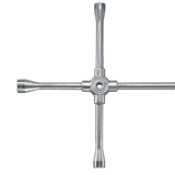
43030006 Wheel braces