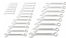
96400805 Combination wrench set