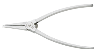
65454102 Circlip pliers for external circlips