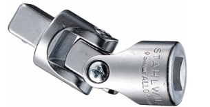
13020000 Universal joint