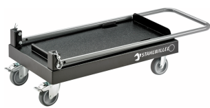
81091009 Tool box trolley