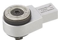
58250004 Fine-tooth ratchet insert adapter