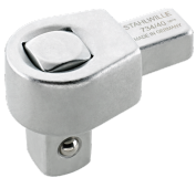
58240040 Square drive shell tool