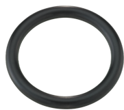
39013650 IMPACT circlip