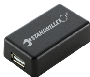
52110061 Interface adapter