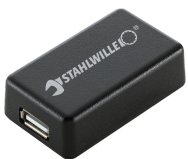
52110061 Interface adaptor