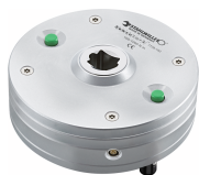
96524020 Transducer laboratory