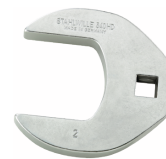
02501034 CROW-FOOT spanner heavy-duty, inch