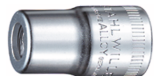
12180030 Bit holder