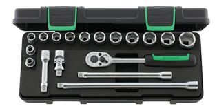
91281855 Socket spanner set