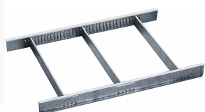
81484001 Drawer separator