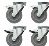
89480003 Set of wheels