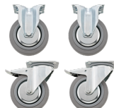
81490005 Set of wheels