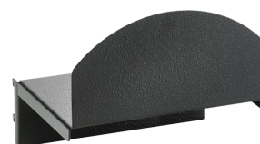
89010040 Cable holder