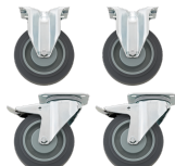
81490001 Set of wheels