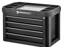
81200157 Tool box