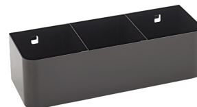
90432727 Spray-can holder