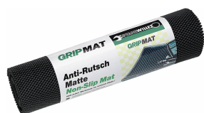
89010003 Non-slip mat GRIPMAT