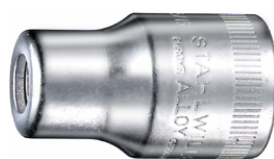
13180010 Bit holder