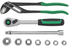
96830278 Supplementary tool set AGRAR MOBIL